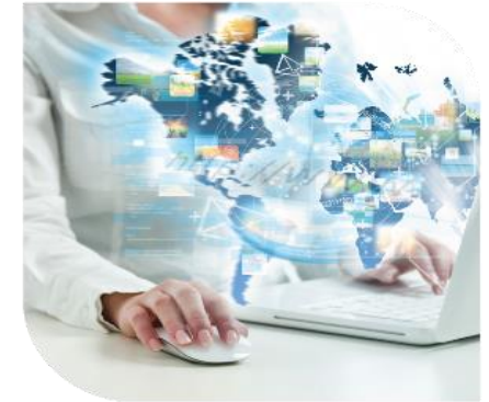
Exposure To Best Practice