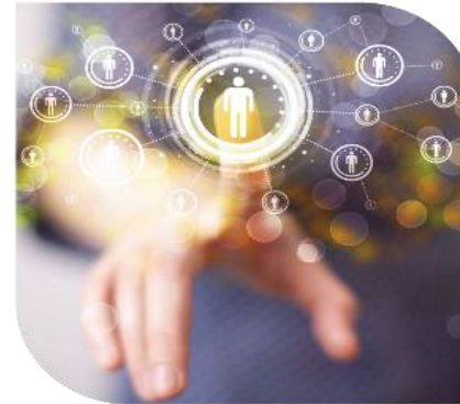
Culture Of Innovation